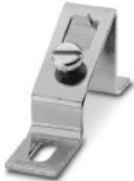
Angled brackets with M6 screw, DIN rail limit stop, for fixing DIN rails at an angle of 30°, with M6 screw, height: 35.4 mm

Please be informed that the data shown in this PDF Document is generated from our Online Catalog. Please find the complete data in the user's documentation. Our General Terms of Use for Downloads are valid ( http://phoenixcontact.com/download )